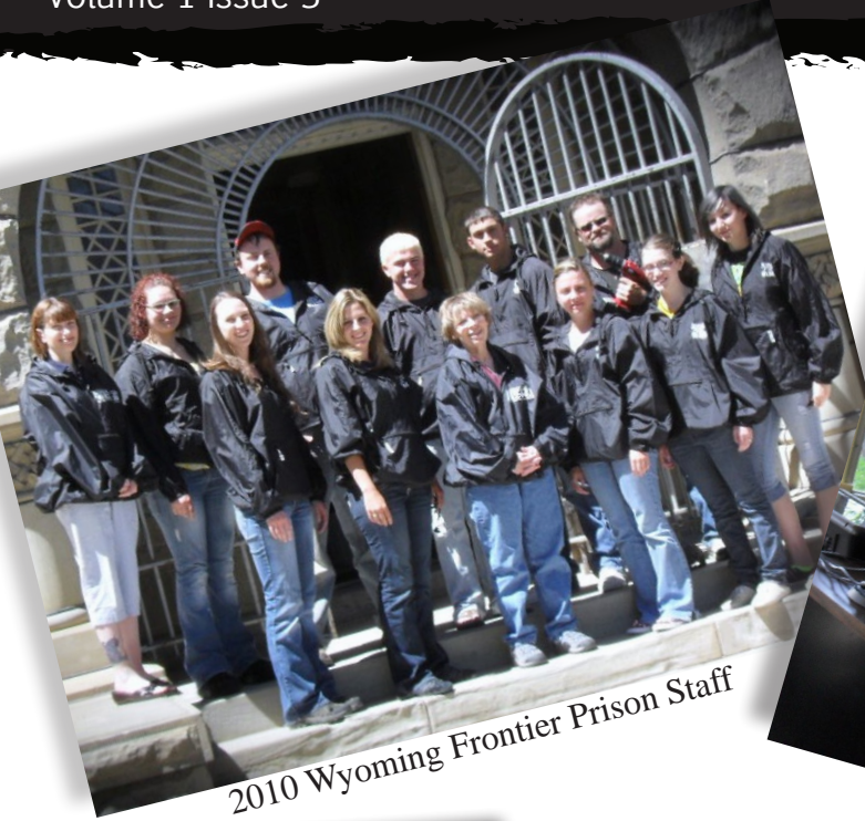
2010 Wyoming Frontier Prison Staff